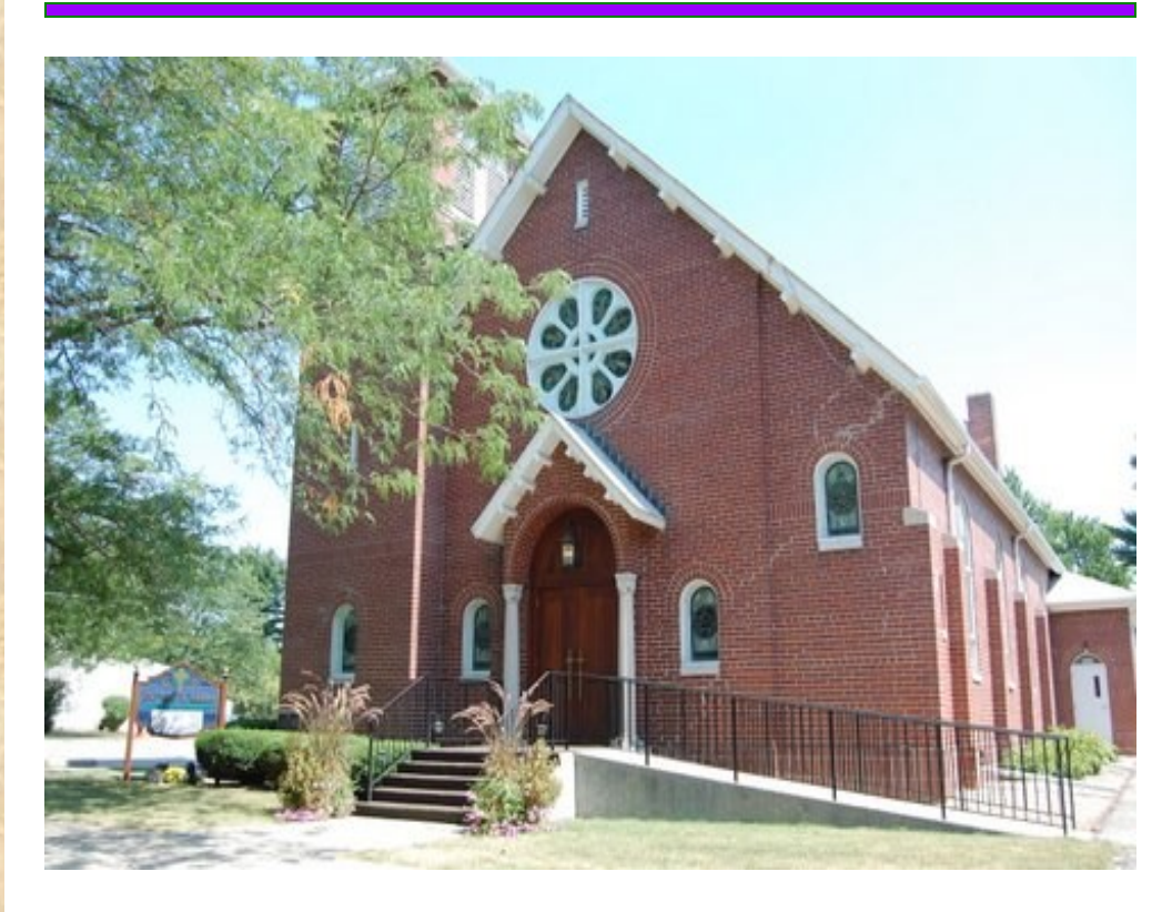
Our Lady of Lourdes Catholic Church