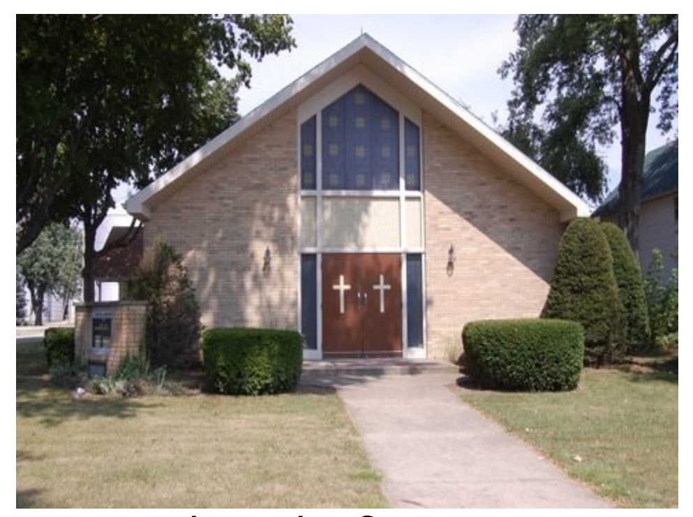
Immaculate Conception Catholic Mission